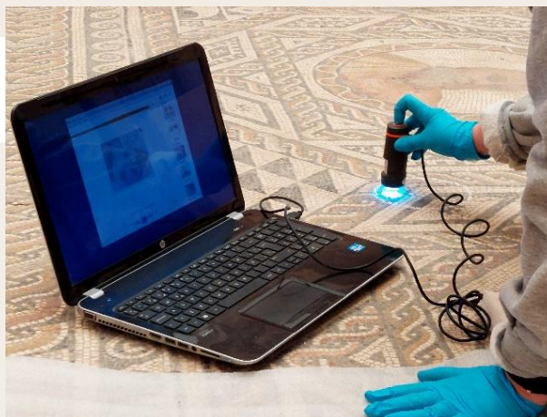
On-site examination of mosaic paving.