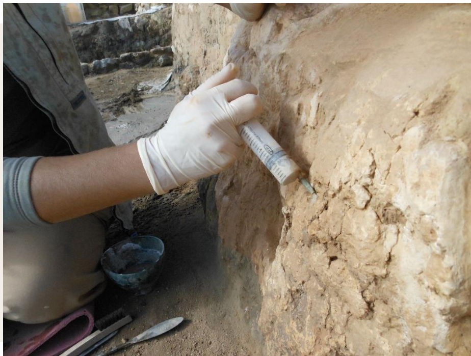
Consolidation of plaster on archaeological sites.

In-person attendance: until full capacity.