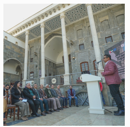
Safeguarding heritage in Ukraine with support of United States