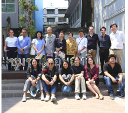
Sustainable development through heritage We wrapped up the first phase of the CH4IG project and are planning the next.