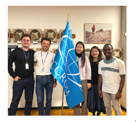
The next generation In the first quarter of 2022, we welcomed one fellow and ten new interns!